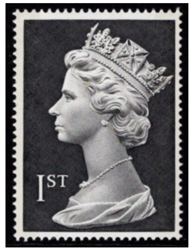
Fig.1. Royal Mail "Profiles in Print" Prestige booklet's 1<sup>ST</sup> Class stamps produced by the printer Enschedé.

Earlier this year four large intaglio color die proofs emerged that are in the 1999 Enschedé Machin 1<sup>ST</sup> Class format but in the colors of the small format Machin high -values also released in 1999. These proofs were acquired by James P. Gough and subsequently shared with the author. The 1<sup>ST</sup> Class stamp, as issued, was part of the Royal Mail Profiles in Print Prestige booklet (Fig. 1).