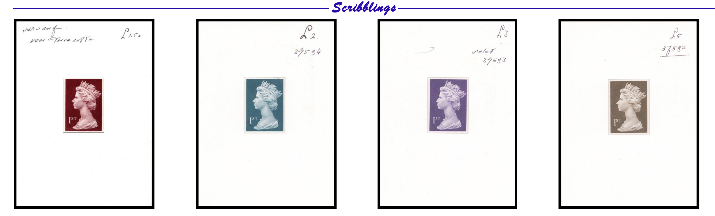
Figs. 2 (Terra-cotta), 3 (Grey-blue), 4 (Purple), 5 (Brown). Enschedé large format color die proofs. The terra-cotta proof is a standalone item and the other three are from the marketing folder shown in Figure 6.