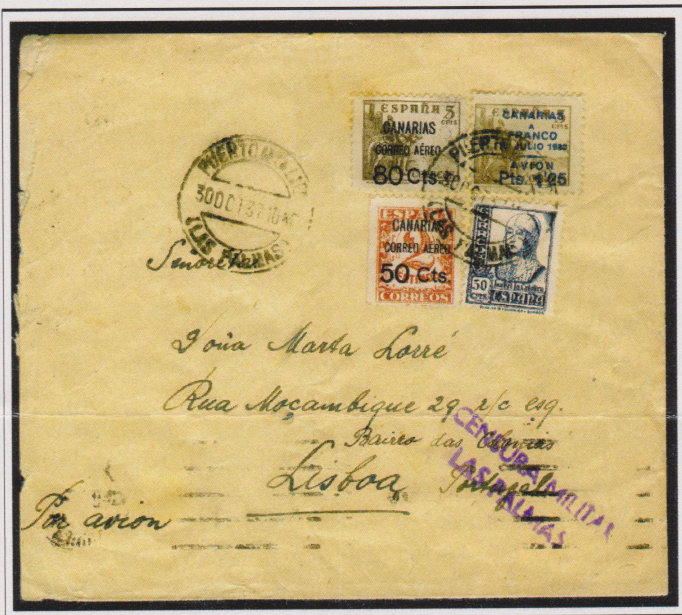
Figure 3. Commercial cover from Las Palmas to Lisbon, Portugal, canceled October 30, 1937. Note the military censor marking in the lower right. Franking is with three different overprinted Canary Islands airmails (Scott 9LC13, 9LC23, 9LC25) and a Spanish stamp.

The middle stamp is one of a set of three charity stamps, not really an airmail, issued for Las Palmas. It shows a plane in flight over a seacoast. The bottom stamp has an airmail overprint issued to commemorate