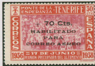
Figure 4. Canary Islands stamps not listed in Scott. They are described in the text.

the third anniversary of a meeting in June 1936 of army officers with General Franco at Monte de la Esperanza.