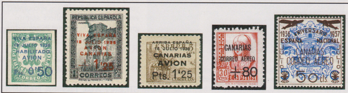
Figure 2. Scott listed Canary Islands airmails. From left: 9LC1, 9LC19, 9LC22, 9LC28 and 9LC31.

To pay for this service, Republican and, later, Nationalist stamps were locally surcharged. Although the overprints often included Nationalist propaganda