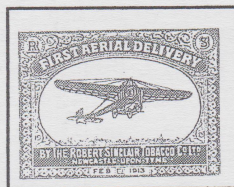
Figure 2. Semiofficial airmail stamp issued by the Sinclair Tobacco Co. in 1913.

The first British SOA was issued by the Robert Sinclair Tobacco Co. During "Flying Week" (February 11-18) in 1913, this dark green stamp (Figure 2) was used on parcels of tobacco flown by B.C. Hucks between Gosforth Park (Newcastle-upon-Tyne) and the nearby towns of Seaham Harbour and Blyth. The stamp, used on a piece of tobacco wrapper, is one of the scarcer British SOAs.