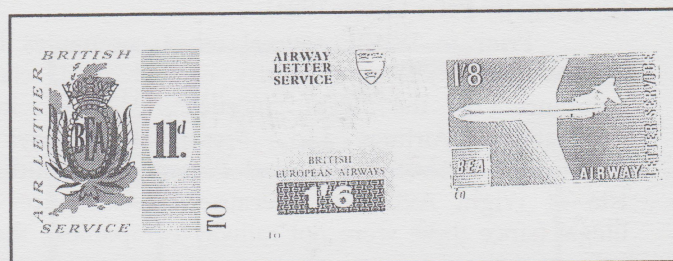
Figure 3. Semiofficial airmail stamps issued by British European Airways in 1951 (left), 1957 (center), and 1964 (right).

this exception. In 1933 the Great Western Railway (GWR) began a passenger air service and used its planes to carry some railway letters. Since the Acts don't specify