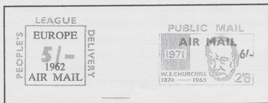
Figure 1. Strike post airmail labels issued during the British mail strikes of 1962 (left) and 1971 (right).

Although the British postal service has never issued an airmail stamp, British semiofficial airmails (SOAs) are a different story. Beginning in 1913, 50 semiofficial airmails have been issued by companies in Great Britain. The last one appeared in 1983, making it probably the most recently issued SOA in the world. There are also some airmail labels issued during the British mail strikes in 1962 and 1971 (Figure 1). Although these are usually