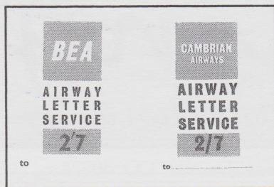
Figure 5 Similar stamps issued by BEA in 1961 (left) and Cambrian Airways in 1964 (right).

continuity allowed these specific airlines to carry mail within the limits of the Post Office Acts. The Airway Letter Service of BEA and, later, British Airways, was the longest running private airmail service in Great Britain. Between 1951 and 1988 it issued 41 different stamps (Figure 3) including one commemorating the first British aerial post between Hendon (London) and Windsor, September, 1911 (Figure 4). Cambrian Airways, a part of BEA, issued stamps on December 2, 1961 having the same design as those issued by BEA on October 4, 1961, but with the name "BEA" replaced by "Cambrian Airways" (Figure 5). The Airway Letter Service ended in 1988 when it became uneconomical ( Airway Letters of the United Kingdom by Peter Lister, 1994).