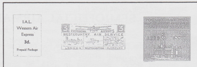
Figure 6 Semiofficial airmail stamps issued by International Airlines Ltd. (left, 1933), Provincial Airways Ltd. (center, 1933) and Portsmouth, Southsea, & Isle of Wight Aviation Ltd. (right, 1934). All were illegal mail services.

There is much more to know about the airmail stamps of the British Isles than the editor will permit me to include. The books cited here will give you a good start on learning about them.