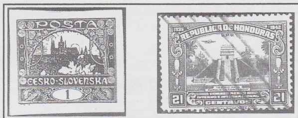
Left: Stamp artwork by Alphonse Mucha. Right: Mayan Ruins at Copán, Honduras. Both topics are scheduled Second Saturday programs.

Art and archeology history are on the menu for the July and August Second Saturday programs at the library.