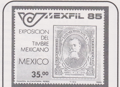
One of a set of three stamps issued by Mexico for an international exhibition in Mexico City in 1985.

But for MEPSIOAXACA 2003, all was arranged and seemingly in order. We were all very excited about this stamp happening! Official release and first day of issue were to be at the exhibition on opening day. The winning design shows a pair of the Hidalgo Head issue (a classic stamp issued from 1868 to 1872) black ink on green paper, 12-centavos, overprinted with the numbers 23, for the Oaxaca postal district, and 71, for the year of issue of 1871. They are cancelled with a single Oaxaca postmark dated February 1872. Also shown is a facsimile postmark in the same style but dated February 2003, to be used at the exhibition. But alas, SEPOMEX late last year demanded an additional 100,000 pesos (about $10,000!) from the organizers in Oaxaca. They were unable to raise the funds and the commemorative stamp was not issued. That's not the kind of "cancellation" we were looking forward to getting in Oaxaca! Nevertheless, the show went on to be a huge success. Great exhibits, a fantastic location, super hospitality and clear, warm weather all contributed to an unforgettable experience!