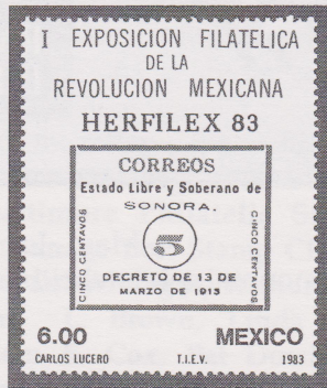
Stamp issued by Mexico for an international exhibition in Hermosillo, Sonora, in 1983.

Mexico City, 1983 in Hermosillo, 1985 in Mexico City, and 1988 in Monterrey. Our society name, Mexico Elmhurst Philatelic Society International, was spelled out on the 1979 stamp (Scott No. C605) and on the 1985 souvenir sheet (Scott No. 1385.). The name of the 1988 meeting and exhibition in Monterrey, MEPSIRREY '88, was featured across the top of the stamp issued for that event (Scott Nos. 1545 - 47).