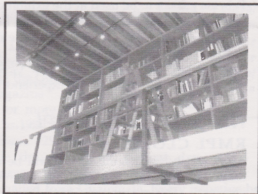
Shelves on the mezzanine level of the Cossío Library room.