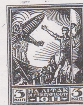
6. Zhmerinka, OSO Aviakhim, first issue, 1932. 3k green on white paper. Issued to raise funds for construction of the "Airplane named after First All-Ukraine Rally of Young Pioneers".