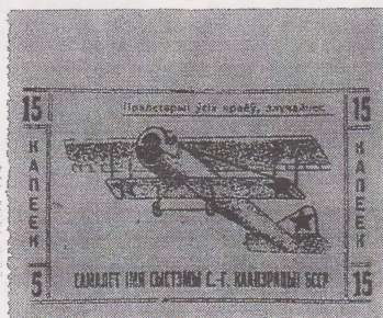
7. Gomel, ODFV, second issue, November 1932. 15k black on pink paper. Slogan in Byelorussian: "For collection of funds for construction of the Airplane named after the System of Agricultural Cooperation of BSSR".