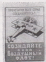
3. Aviakhim Central Council, first regional issue, August-September 1925. Red and Black on cream paper, on value indicated; printed in Odessa. Text reads: "Workers of the World Unite // RSFSR // Create Your Air Fleet"