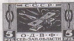
5. ODFV Northwest region (Petrograd, Leningrad), first issue, April 1923. 5 ruble yellow, purple, and brown on white paper.