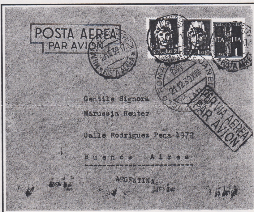
Figure 1: First flight cover from the inauguration of LATI service to South America, the piece was cancelled in Rome on the 19th, received the LATI cancellation of the 21st, and taken aboard the west bound flight.

Twice a month service followed for the next 6 months, with service reduced to once a month in June, 1940. To facilitate mail transfer, agreements were reached with other Latin American airlines regarding the transport and handling of LATI air mail. Within Brazil, most LATI mail was transported aboard CONDOR flights, thus leading to the CONDOR-LATI connection that enabled both airlines to survive for two more years.